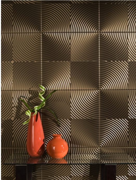
Advanced Technology in Greensboro produces decorative laminate sold in do-it-yourself retail chains.

Advanced Technology, Inc. chose to adopt a quality management system based not on the mandate of a client, which is typically the case, but to regain control of their production.